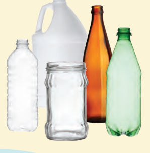
Rinsed Bottles, Jars, & Jugs (Glass and Plastic)

Hunterdon County Recycle Often, Recycle Right